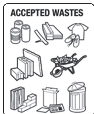
Garden household (exc.food) and builders or DIY waste